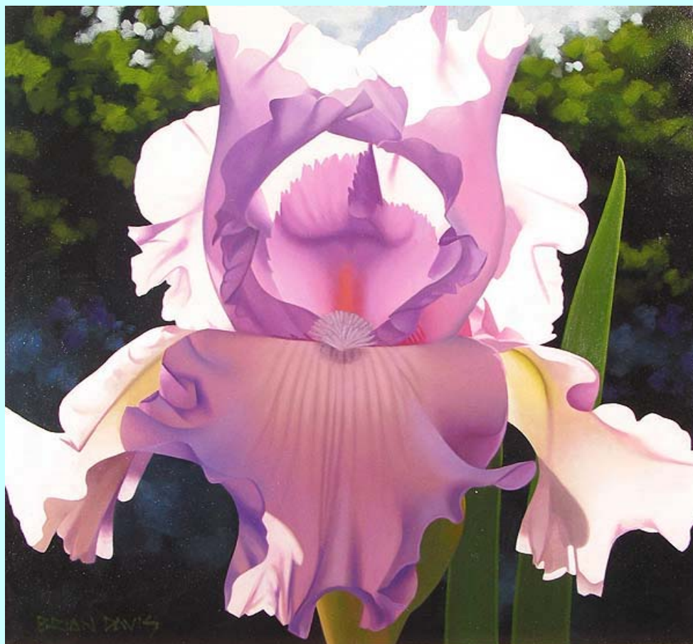
"SOLO MAUVE IRIS" ORIGINAL OIL ON CANVAS 24X24