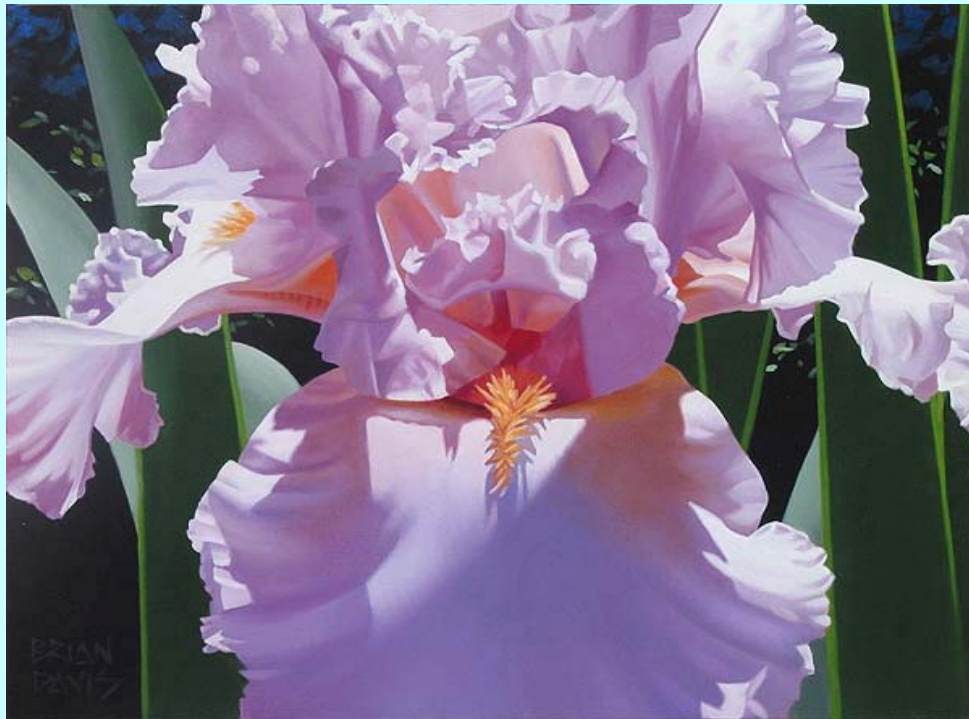
"BURNING PASSION" ORIGINAL OIL ON CANVAS 20X20 THIS PIECE IS SOLD